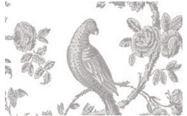
Bird, looking right

For each unique sheet in the design, the creature on that sheet will either appear towards the top or the bottom of the sheet. This allows us to distinguish and number each individual sheet as follows: