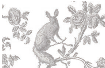
Squirrel, tail down