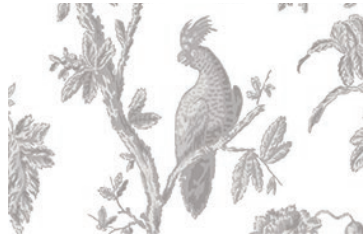
Bird, looking left