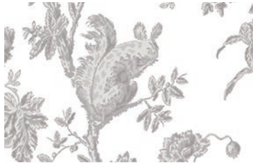
Squirrel, tail up

Firstly, notice that there are four distinct creatures in this design, which we have named as follows: